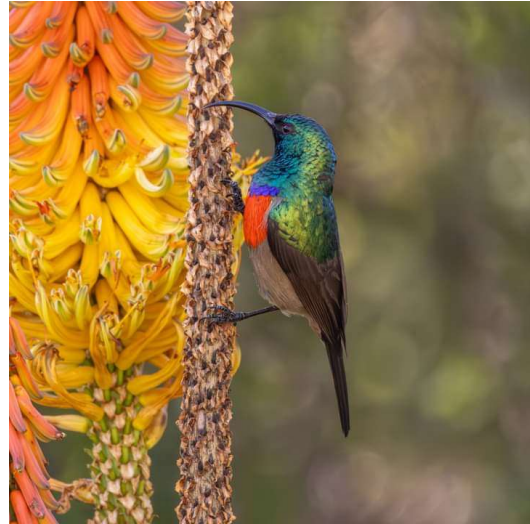
Greater Double-collared Sunbird