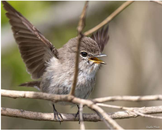
African Dusky Flycatcher